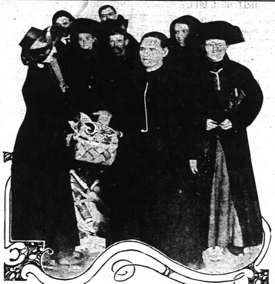
The Christmas season has been a busy one for the Salvation Army. Wednesday 400 baskets were distributed to the unfortunate; Thursday a special dinner to men was served at the Industrial Home on Whitehall street; and Friday a Christmas tree furnished presents to 600 poor people.