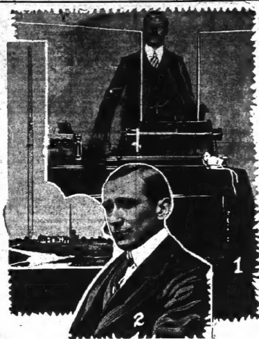
1. WIRELESS APPARATUS IN OPERATION. 2. MARCONI.

Inventor William Marconi has demonstrated the possibility of transmitting light by wireless power. He has constructed a lamp which can be lighted by wireless power at a distance of 100 feet.