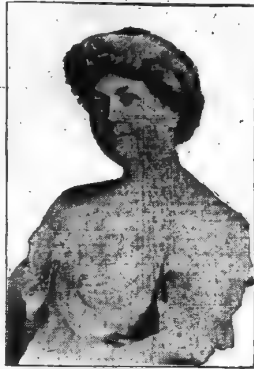
MRS. WOODROW WILSON Wife of the President

This Book is a Splendid Proof of the Co-operative Spirit Among Women of Today