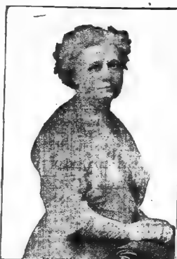
MRS. WILLIAM JENNINGS BRYAN Wife of the Secretary of State