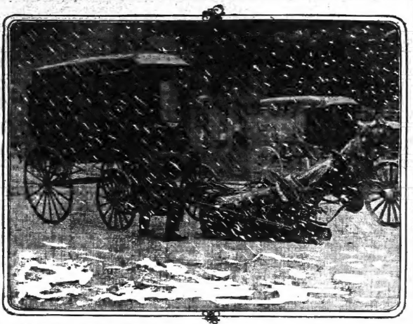
There were many such accidents during snow of Wednesday. Horses found it very hard to keep their footing due to the slippery streets.