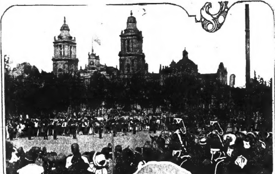
SQUARE IN FRONT OF NATIONAL PALACE, MEXICO CITY