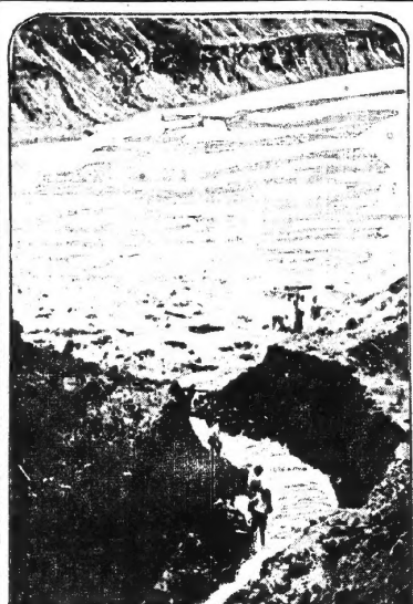
CUTTING CHANNEL THROUGH CUCARACHA SLIDE, CULEBRA CUT.

This picture is important as well as interesting. It shows a narrow channel cut in the Cucaracha slide in Culebra cut in the Panama canal. The explosion of Gamboa dike was historic, but as a matter of fact it did not completely sever the waterway between the two oceans.