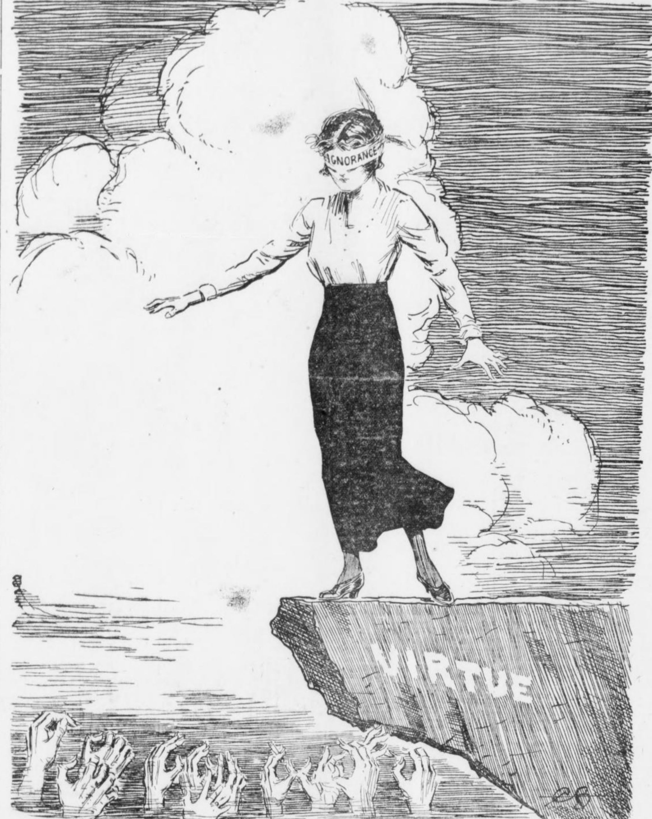
Before the little fledglings leave their nest, the mother bird has taught | With dancing feet that scarcely touch the sod-the maiden's joy of live But human mothers fail to meet this test, and so their daughters flutter- How shall she learn to follow paths untrod, unguided, helpless, under hile mothers teach that innocence is best, that life is fair and blue and How can she guess the road that leads to God must bridge the grim abyss