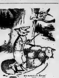
"Who says Granny Fox is stupid?" he snarled.