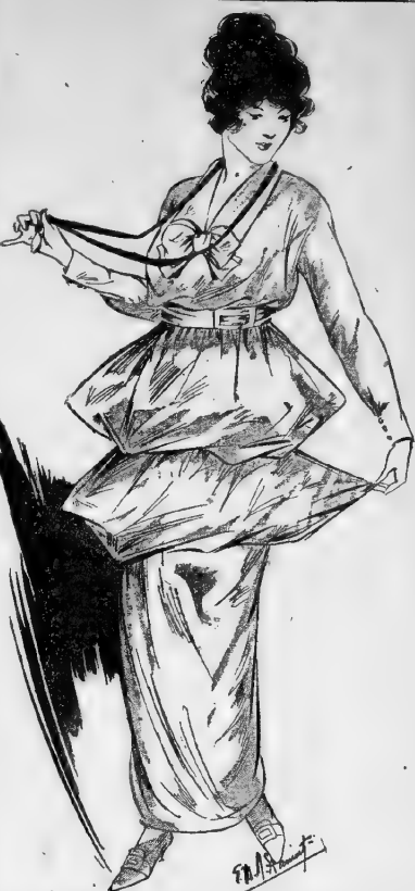
The tunic, perfect tunic is a novelty. This frock by Oshkosh is made of white satin.