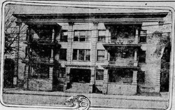
Apartment houses have figured extensively in real estate sales or exchange of late. The illustration shows the Corbin apartment at 120 West Peachtree street, which figured in a $64,500 exchange of property handled by the M. C. Kiser agency.