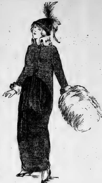
Dyed furs are still exploited. With this coat of plum minkless and skirt of black velvet a yellow fox mink is...