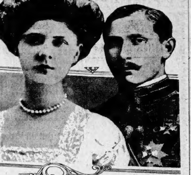
Prince Arthur of Connaught, son of the Duke of Connaught, governor general of Canada...