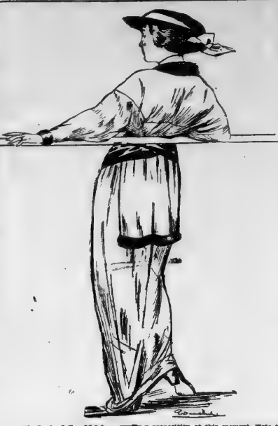
The look of the skirt is a pleasing proportion at this moment. Note the open effect on this blue serge model.