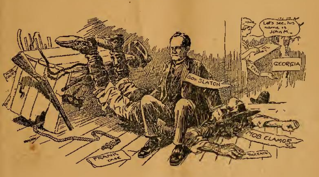
JEW CARTOON-SLATON SUPPRESSING "MOB LAW."

But Slaton felt no pity; he devoted no anxious days and nights to the study of that case: he made no mysterious visits to New York while that case was pending: and he had nothing to say against circumstantial evidence, then.