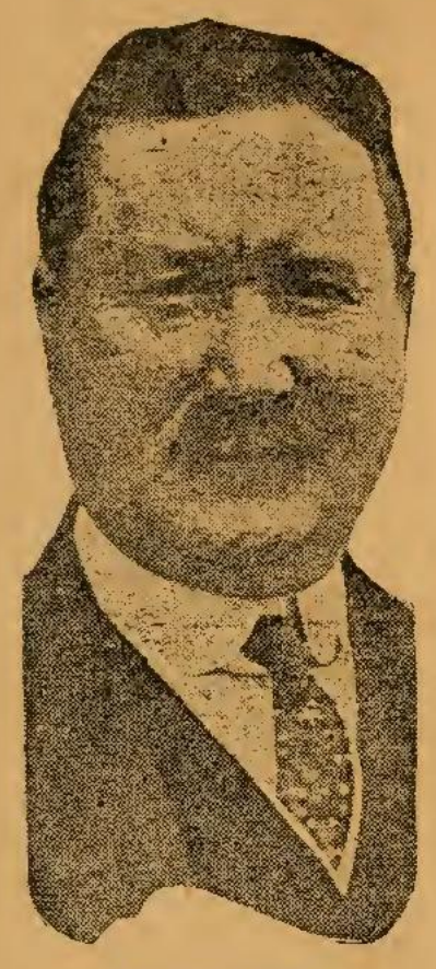
THE NOBLE BURNS.

Even the sapient Burns realized to the full the enormous weight of those six or eight strands of woman's hair,