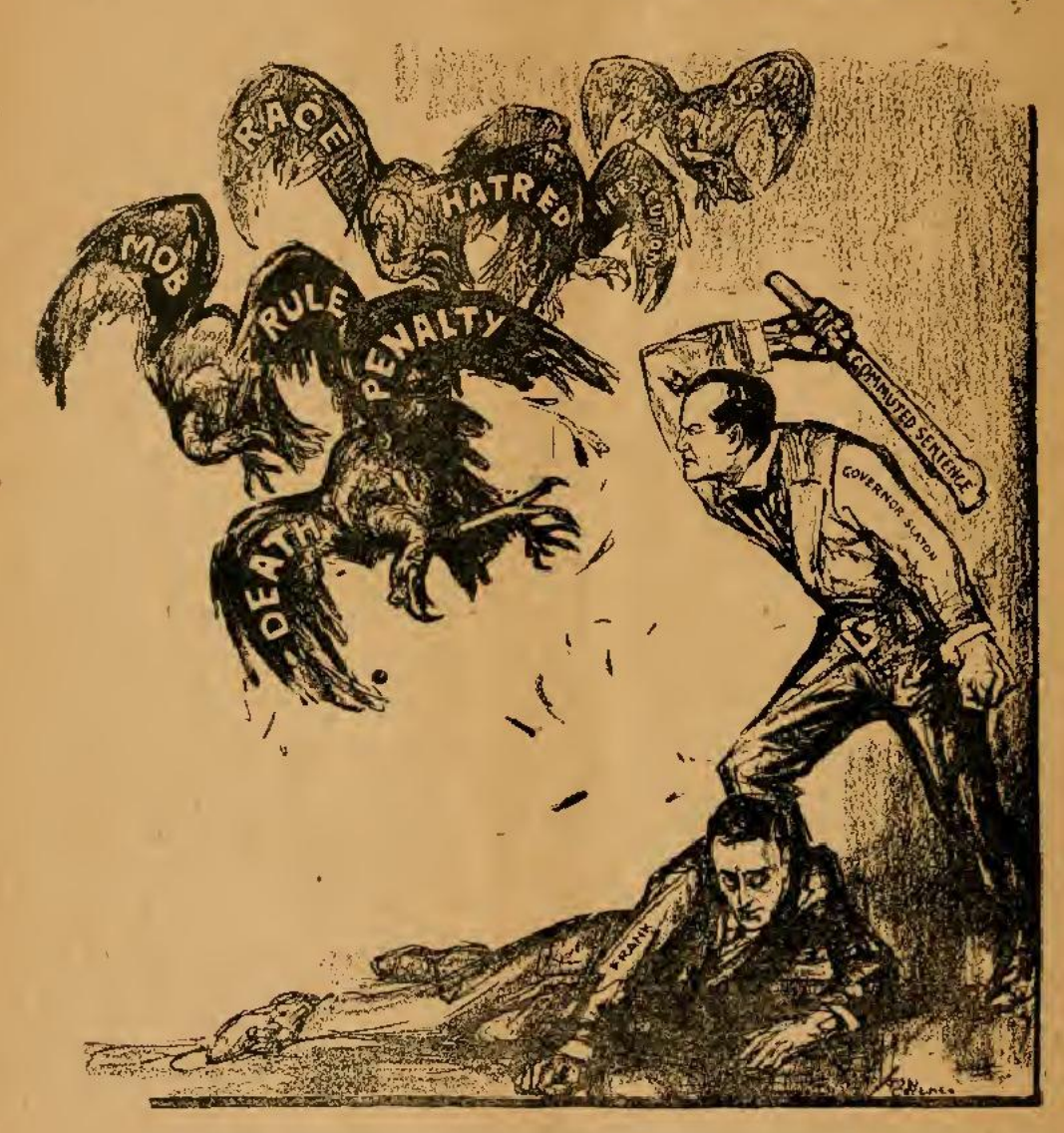
GOVERNOR SLATON BEATING OFF THE VULTURES .- From Strage' Puck,

Blackstone expressly says that it would be against all correct principles, to allow the power of judging and of