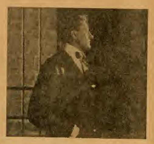
LEO FRANK, IDEALIZED IN THE HEARST-SELIG MOVING PICTURES.

close to the man whose active brain dictated those notes.